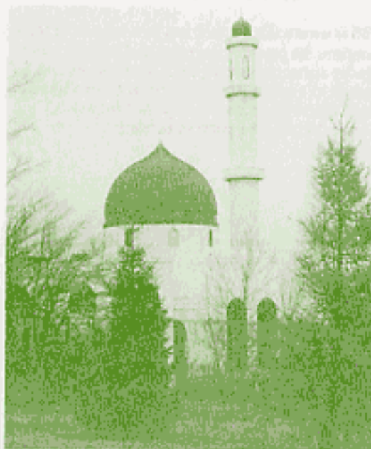
A new mosque in Canada